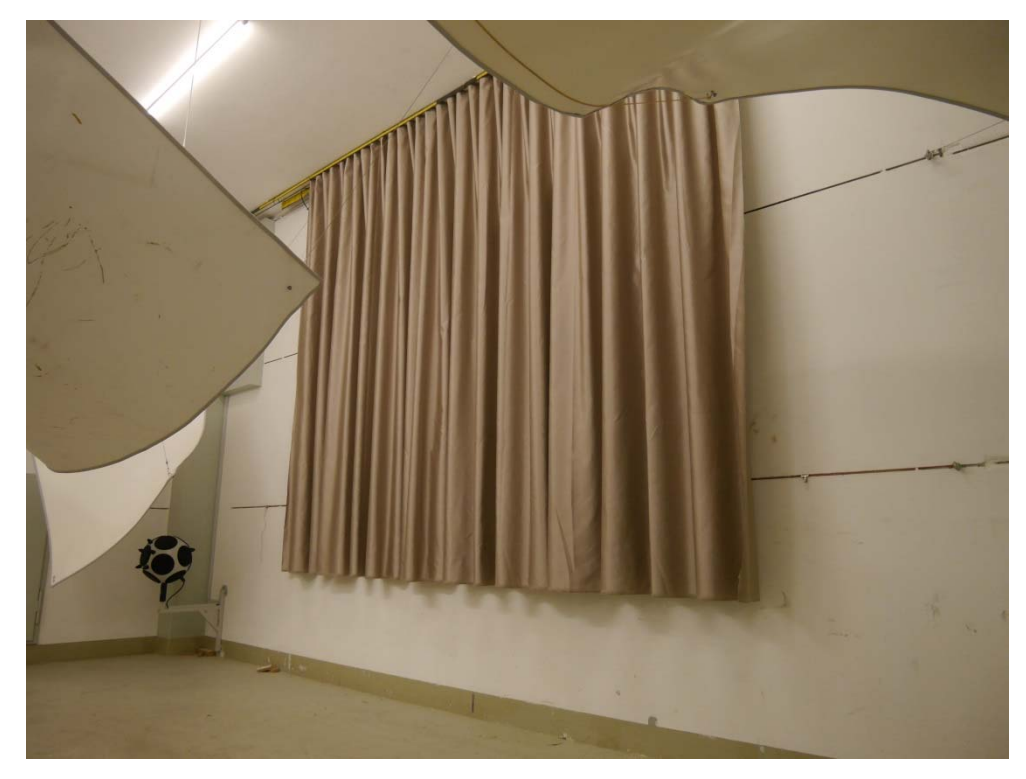
Figure B.2. Test object mounted in the reverberation room, diagonal view.