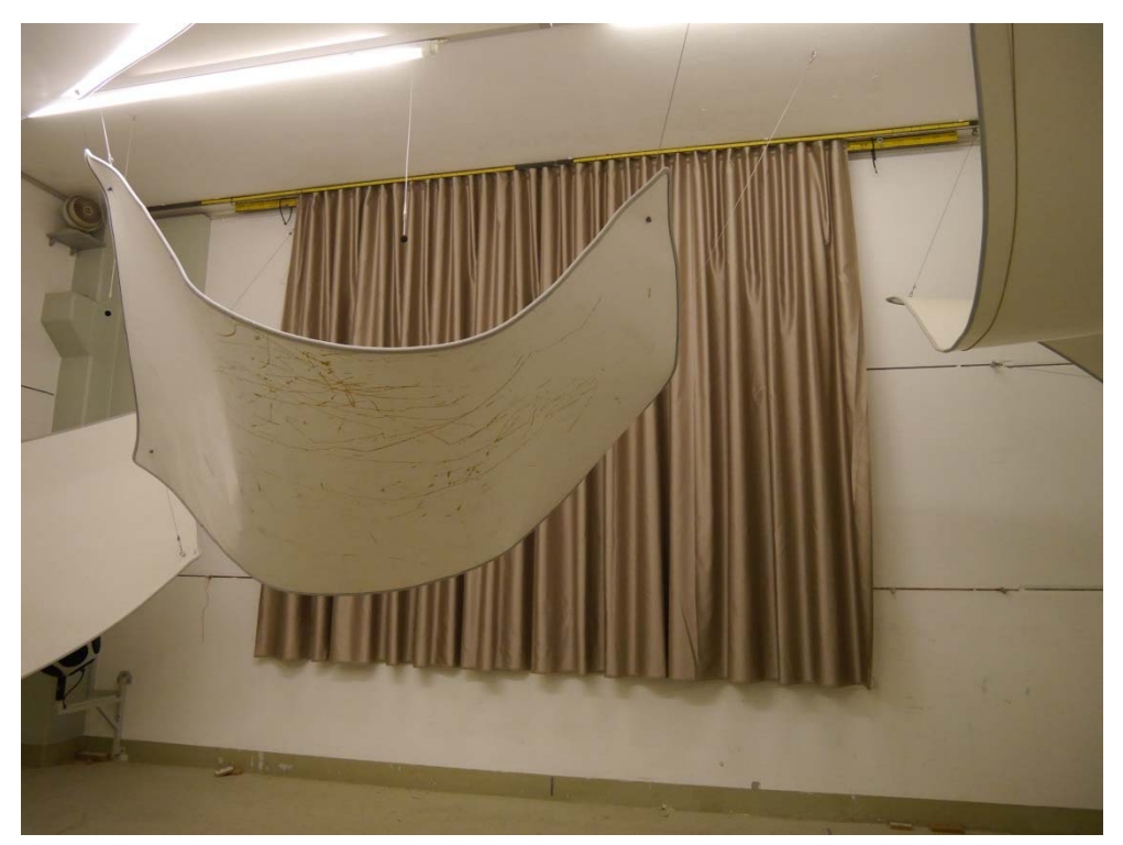
Figure B.1. Test object mounted in the reverberation room, frontal view.

Fabric Solice, art.-no. 10416/ Solice Stripe, art.-no. 10502/ Solice MAT RE FR, art.-no. 10886/ Solena, art.-no. 10501, Zimmer + Rohde GmbH